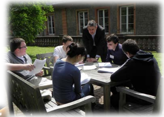
Group work on campus