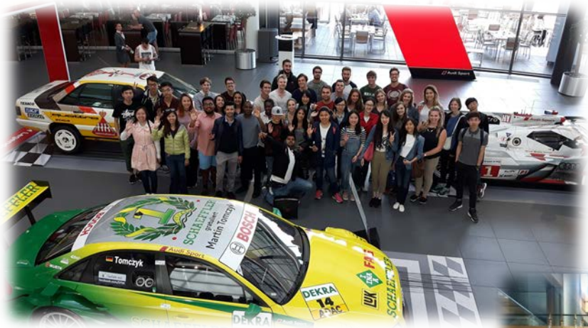
AUDI car manufacturer