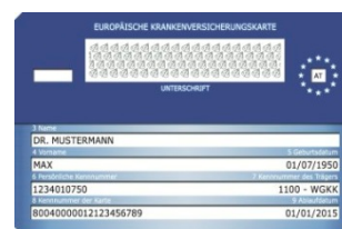
European Health Insurance Card

Please be aware that with most insurances the fees when using the hospital or doctor services have to be advanced.